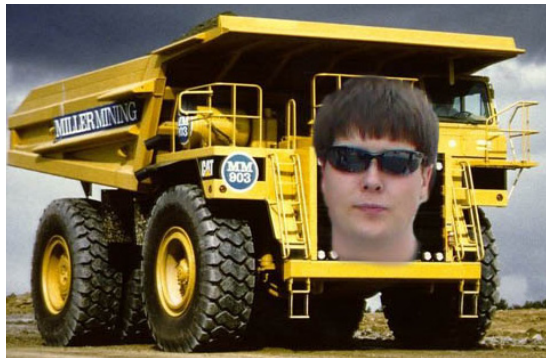
Referees spent several minutes wondering how to attach a flag football belt to a truck, but ceased their wonderment when it ran them over with its enormous list of YouTube favorites.