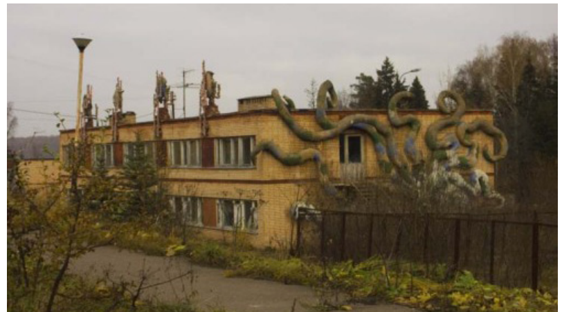
Dude, I would totally go to a place that was being consumed by a giant octopus!

Other than the mining related ruins, there aren't a ton of other abandoned places to explore in the Houghton area. I hear Marquette has a partially abandoned psychiatric hospital someplace. There are also tons of ruined farmhouses and ghost towns to stumble upon throughout the U.P. And if you're downstate... well, I don't think I need to tell you where Detroit is. Just watch out for druggies, I've heard they're fierce in those parts.