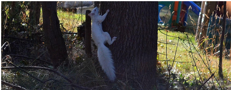
The first evidence of the elusive squirrel in nearly 2 years... Clever Girl...

After doing some research, we were able to confirm the forestry major's allegations. Chipmunks are as intelligent and annoying as an engineer, while a