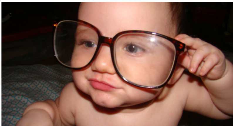
Hipster baby has no time for pacifiers. Or for MTU. They're both way too mainstream.

Many students are wondering who will take the hipsters' place now that they're all leaving or if one day they'll come back, but for now let's all enjoy the lack of judgment on what we're wearing and what music we like. ☺