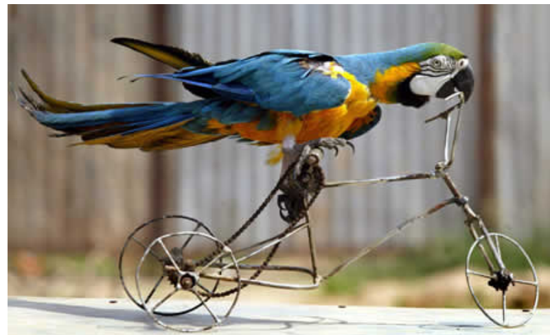
Drive-by parrot trolling - a new epidemic sweeping the nation's pet owners.

My hand went to my volleyball to smash that fishbowl, parrot and all. It knocked over the crate, he flew free, and thus ensued a bitter war. I lunged for his head, craving a fight, but he went and plowed through the light, Zipped out the window, and into the night, my parting shot, a fearsome roar. And so I went back and studied Fourier, Newton, Maxwell, and Bohr But quoth the parrot "Nevermore."