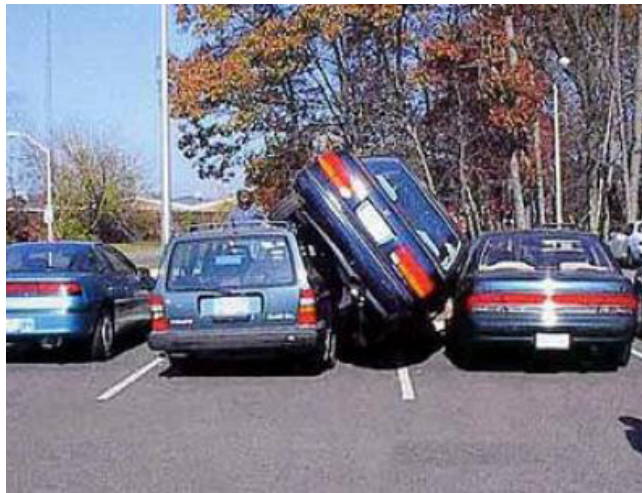
The need for parking wars between the academic classes was fully realized after students took drastic action to get a space in the St. Albert's lot.

since silly freshman live on campus and don't really need their cars. They match a freshman with a junior, senior, or super senior and then summon the two parties down into the parking lot, to the exact spot that the upperclassman would be issued. They then allow each party to choose a weapon, and they battle over the parking spot. The hope is that the upperclassmen will simply scare the ever-loving shit out of all freshmen, hence creating this 'blood feud' between the classes over parking.