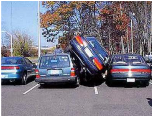
The need for parking wars between the academic classes was fully realized after students took drastic action to get a space in the St. Albert's lot.

since silly freshman live on campus and don't really need their cars. They match a freshman with a junior, senior, or super senior and then summon the two parties down into the parking lot, to the exact spot that the upperclassman would be issued. They then allow each party to choose a weapon, and they battle over the parking spot. The hope is that the upperclassmen will simply scare the ever-loving shit out of all freshmen, hence creating this 'blood feud' between the classes over parking.