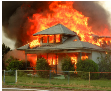
It is said the DC area man also had financial problems, and that arsony was likely.

The man approached his stove, turned it on, and then left to go tend to other things. The house subsequently went up in flames from the