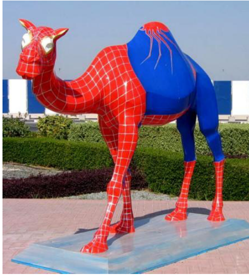
The perpetrating camel was unavailable for comment. Eyewitnesses say that he climbed an area building in order to escape the murder scene. Experts are investigating whether this hybrid spider-camel is also a creation of the Brain Pathers' crazed team.

The body of a senior student at Michigan Tech was found at the fairgrounds this past weekend. Many rumors as to his death have since been circulating. It is assumed that he died during the festivities of the annual Houghton County Fair, and there is the possibility of foul play.