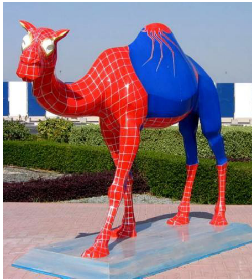
The perpetrating camel was unavailable for comment. Eyewitnesses say that he climbed an area building in order to escape the murder scene. Experts are investigating whether this hybrid spider-camel is also a creation of the Brain Pathers' crazed team.

The body of a senior student at Michigan Tech was found at the fairgrounds this past weekend. Many rumors as to his death have since been circulating. It is assumed that he died during the festivities of the annual Houghton County Fair, and there is the possibility of foul play.