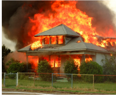
It is said the DC area man also had financial problems, and that arsony was likely.

The man approached his stove, turned it on, and then left to go tend to other things. The house subsequently went up in flames from the