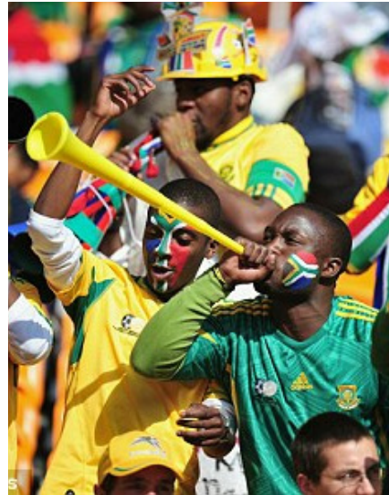
Especially these. REALLY especially these.

To the disappointment of most students on campus dorm housing has banned the use of all musical instruments. This decision was made after a student organization gave out rare vintage guitars and $2000 drum sets during Spring Fling. What had proved to at first bring excitement had eventually resulted in protest about not being able to study for finals. Due to the overwhelming amount of “shut up I am trying to study” by both students and Resident Assistants, housing staff decided to ban the use of all instruments in and or around the vicinity of the dorms. Instruments that are on the ban list and will get smashed by the ban hammer if played are: drums, guitars, wind instruments, harps, maracas, grand pianos, trumpets, quoin----, banjos, ukuleles, tribal bone xylophones, and spoons and pans. To accommodate for different cultures, housing will allow for