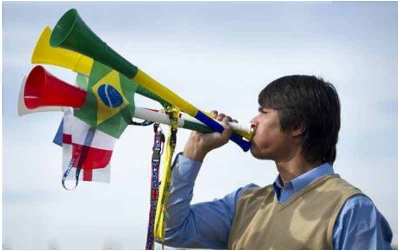
Wow! Look at this multiculturalist person. He's all for like 7 different countries! That's multi-culturalist. GOGO.