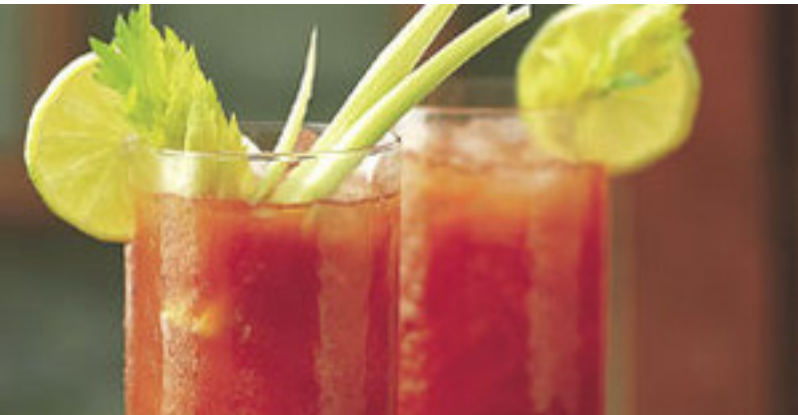
Now you can REALLY make a nice Bloody Mary! Just collect blood from Mary. Enjoy~

The CDC has begun ranking colleges by average BAC and advising against blood drives on campuses which receive deficient scores. These measures would include mandatory breathalyzer tests for all participants. Michigan Tech appears at the bottom of the preliminary list and will be required to provide breathalyzer tests "until the end of time." 🤖