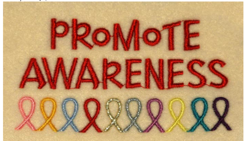
I think that the day went well for awareness everywhere. I learned of some awareness days that I had never heard of. Carpenter Ant Awareness Week, Potty Training Awareness Month, And Antiphospholipid Antibody Syndrome Awareness month.