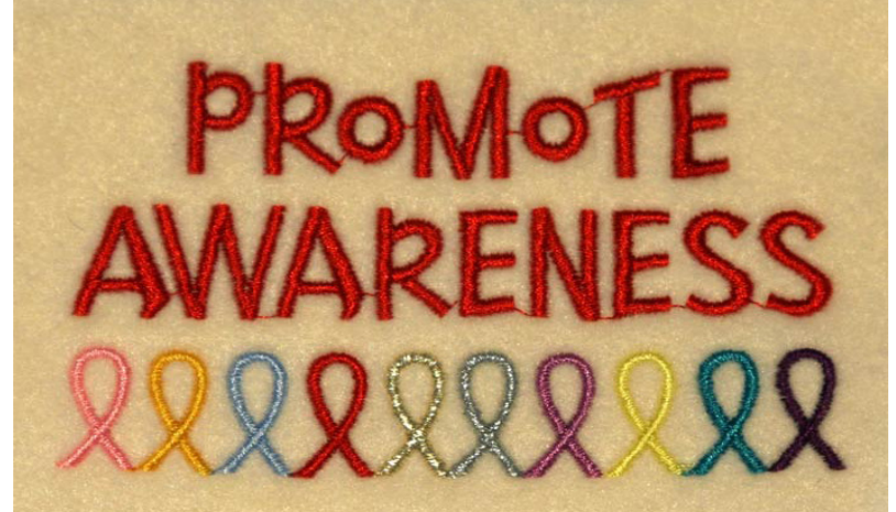
I think that the day went well for awareness everywhere. I learned of some awareness days that I had never heard of. Carpenter Ant Awareness Week, Potty Training Awareness Month, And Antiphospholipid Antibody Syndrome Awareness month.

[ Editor's Note; Big O would like to apologize for this. I was busy playing on my PSP. ] 🍷