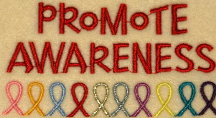
I think that the day went well for awareness everywhere. I learned of some awareness days that I had never heard of. Carpenter Ant Awareness Week, Potty Training Awareness Month, And Antiphospholipid Antibody Syndrome Awareness month.