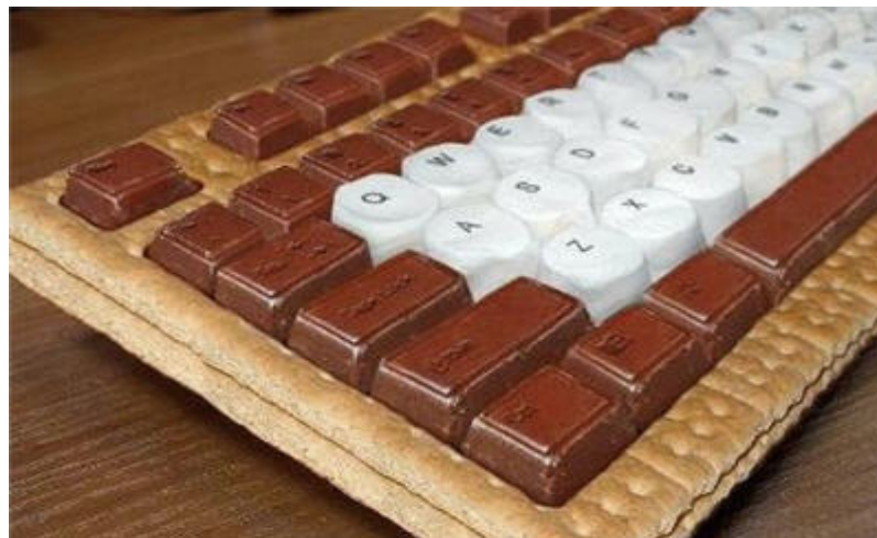
I wonder if this keyboard has any sticky keys... those really suck! Or maybe are delicious.

Whatever Presidents' Day is about, enj—ah, fuck it. 🐮