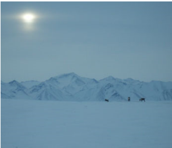
Of course it is possible that he just wandered off into the frozen tundra of Houghton. Afterall, it's hard enough to see...

want revenge. Most professors were seen fleeing the building as well, and since it happened on a Friday no one was overly concerned about taking a head count and just got started on their weekend.