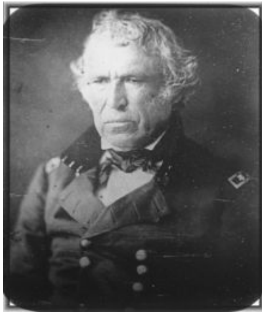
Considering he only wore his uniform twice ever, what was the point of President's Day?

Now, don't get me wrong... I love Presidents' Day. I mean, what with all the mail not being sent and banks not being open, it's the best! But why do we celebrate it every year? Well I did some personal research and discovered the shocking truth.