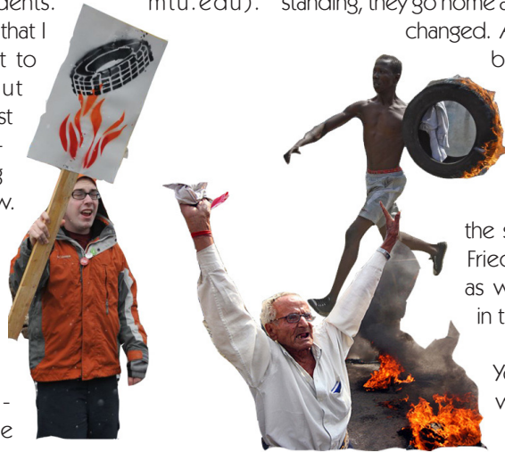
So if you're burning tires, then is that a burnout?

Social Networking Fail 101: A Look into Egypt. HU 2442 Fall 2011