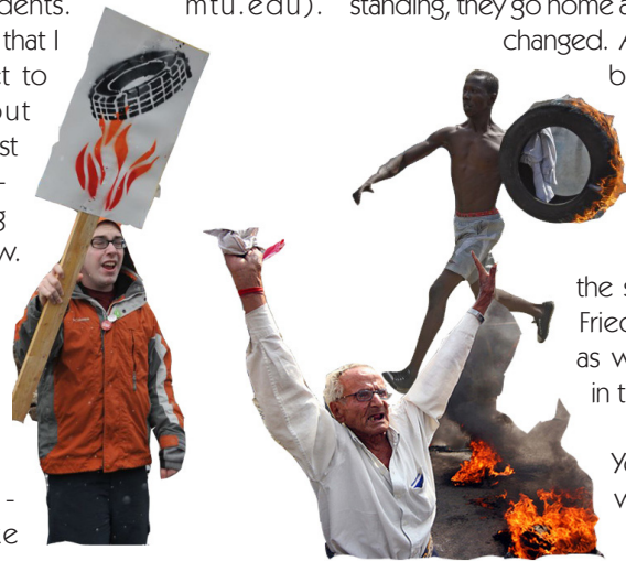
So if you're burning tires, then is that a burnout?

Social Networking Fail 101: A Look into Egypt. HU 2442 Fall 2011