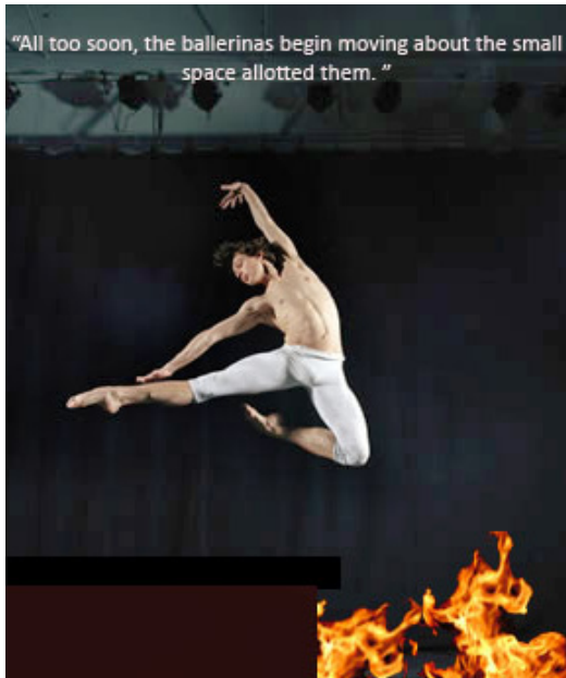
"All too soon, the ballerinas begin moving about the small space allotted them."