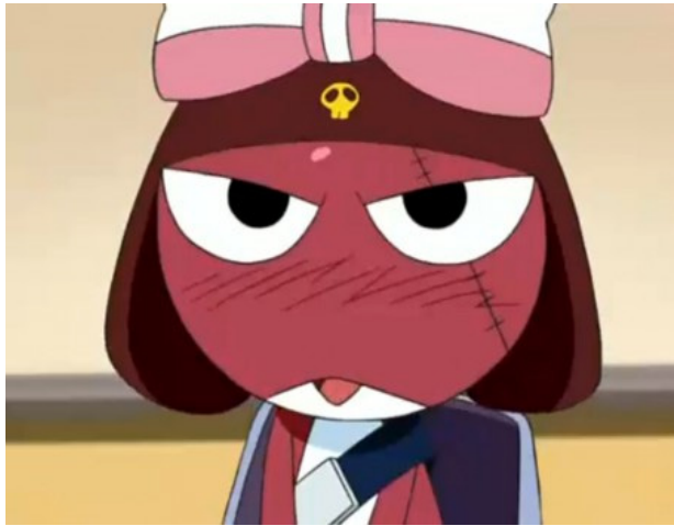
A similar occurrence has happened before in Japan...

... From Spacel from front per Peninsula of Michigan, where Bugs Bunny was reported to once try going, the researchers were trying to figure out the rate of rigor mortis for the creatures, or if post mortem for these creatures caused different effects. The body for research arrived and was extremely flexible and "quite bendy" – as one student worker suggested.