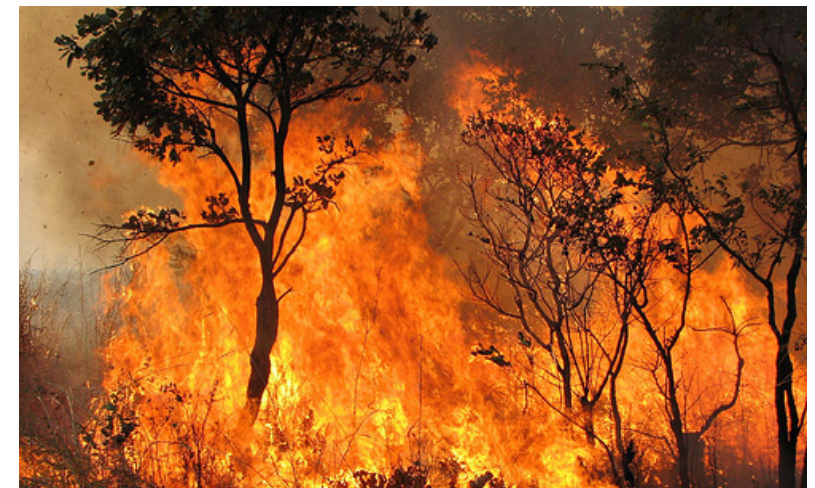
Like, omigod! I think I left one of my diamond-studded 24k gold Prada stilletoes sitting on the marble counter next to my venti double-shot espresso frappuccino cappuccino mocha latte frappe! Daaaaaddy! Tell the first to stop!

Some scholars have detected seismic activity in a normally seismically inactive region, hinting that God might be erecting two massive stone tablets to remind people of the commandments they don’t follow. Some just think it’s an earthquake, and that the fire is just a rapid heat catalyzed chemical exchange between oxygen and a fuel source, resulting in carbon dioxide and water as the main byproducts of the reaction.