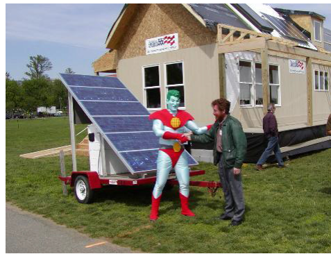
Saving the world, one solar panel and smashed up house at a time.

Captain Planet even took on Hitler! The Planeteers somehow had to go back in time and keep "the representation of science harming nature" scientist woman from selling a nuclear weapon to the Germans during World War 2.