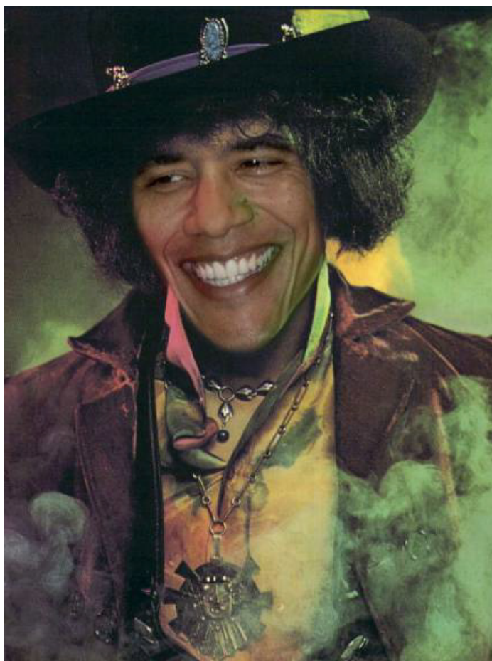
I wish I had shop skills like this. Thank you Internet.

John McCain's Alzheimers has been acting up severely and he refuses to believe his lost the elections. He views this concert as a ploy to revolt against his "success" and vows to counteract through military means. "Friends, I will first build a Brick Wall