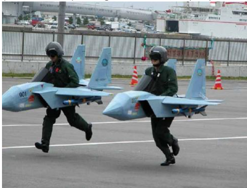
Only in Japan...

Wear funky shoes. Vibram Five Fingers are my favorite shoes to wear in airports. Not only will you be the only one doing so, when you take them off to go through security the x-ray technicians will, without fail, say something about how there are feet going through the scanner. Then you can tell jokes to the security people, who usually won't tolerate any sort of humor whatsoever.