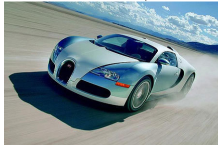
With gas so cheap now I can drive my Bugatti again!

Surfin' Safari. Bummer, dude! With no gas in your tank, how are you supposed to go on Surfin' Safari from Hawaii to the shores of Peru? It's not like you can throw your boards on top of just any car – it's gotta be a woody of course. Otherwise you're not really groovin' to the style of summer.