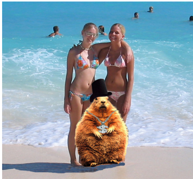
Mr. Phil enjoying himself in sunny Cancun while millions freeze because of his predictions.

... Punxie "The Pimp" Phil from front threw him a curveball wrapped in a fastball wrapped in Canadian bacon. He misjudged.