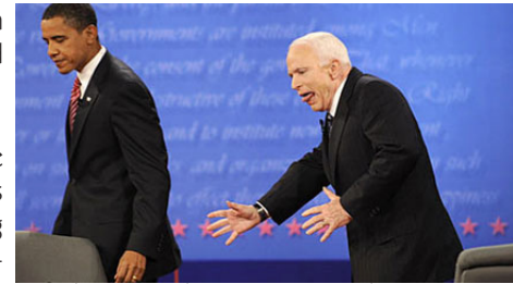
Obama using his poison gas attack on McCain.

tarded sometimes. Like the Electoral College. There wasn't an Electoral College in Roman times. You know what they did instead to find a new ruler? Build up armies and beat the shit out of each other. Why they don't do that nowadays is beyond me.