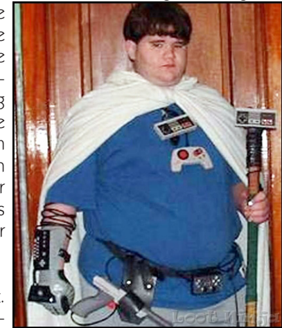
brb going to save the world afk

Think about it. How many people in the world can multitask to the level and intensity that a gamer does? How many people have that level of hand-eye coordination? Hell, how many people are that pasty that they can