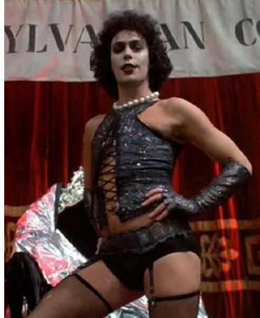
Are you turned on yet?

They could make it into a soft-science nightmare, with clichéd "IT'S ALIIIVE!" moments, improbable love triangles, and aliens who just want to go home. That would be cool, right? What? That was already in RHPS, too? Dang it!