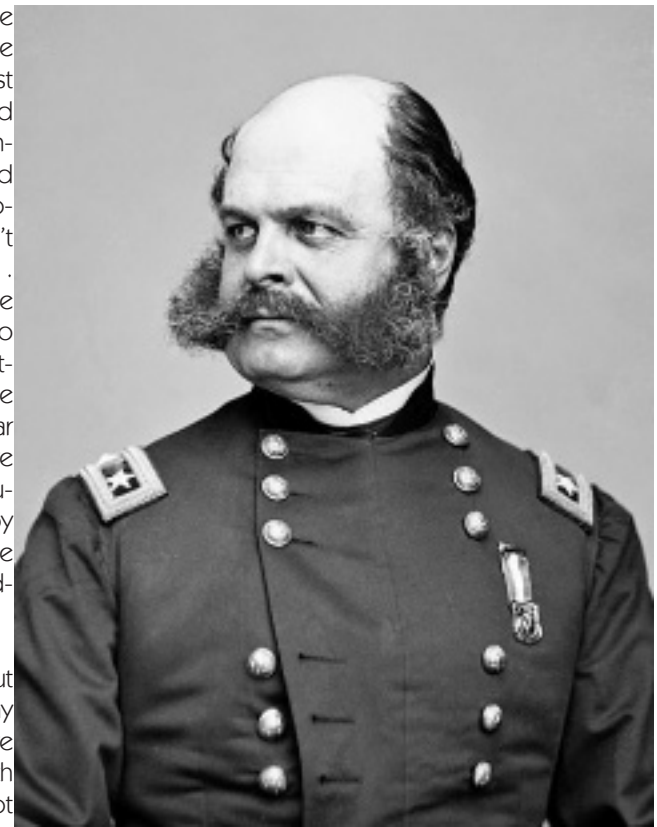
Commiss ain't got nothin' on Ambrose Burnside's

they have a characteristic inability to grow large beards, and in the Vietnam war, we should have used this to our advantage! If all of our soldiers had sported massive chin curtains, the beardless Vietcong would have fled in sheer terror at our unprecedented