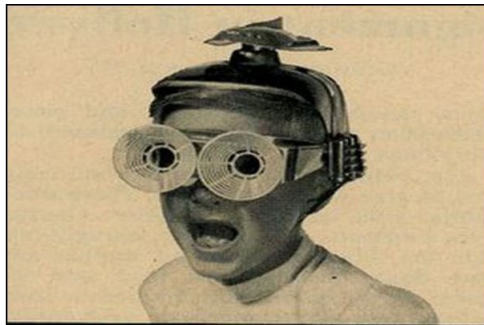
JESUS CHRIST I CAN SEE FOREVER

There I was, innocently taking a shower, by myself, when the first one hit me – a Daily Bull article idea! Of course – I'll write something about being epic. It'll be brilliant and awesome and everything I could ever imagine it would be. But what's this? Something else was coming into the shower with me. "Oh god, not again," I thought to myself. Fortunately it wasn't another dude... unfortunately, it was something far more sinister.