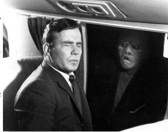
SHATNER CAN SEE THE GREMLINS!!!

Yeah, you always get the fat, stinky ...see Flying on back