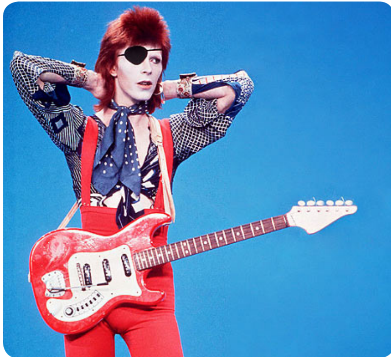
Major Tom's Spacesuit

After defeating Rommel, Tom went on to crush all of the Nazis in the planet, saving the world from countless generations of tyranny and violence. For his valor, Tom was awarded the chance to be the first man in space.