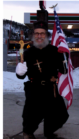
Would you touch this man?

No, this isn't a Photo-shopped image. This is a real-life Prophet, in the flesh, strutting his stuff on his lonely street corner. Little did everyone know, the Prophets have been hiding in the hills of Colorado this whole time, coming out every afternoon for a short time to recharge their preaching powers. The fact that only a handful of employees at a local ski shop knew of their existence shows how well the Prophets had managed to cover up their existence.